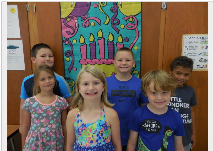
We celebrated July and August Birthdays!

Get Ready to Smile! Cheekwood Studios will be at GV on Tuesday, Sept. 18th to take everyone's picture. Forms will be sent home soon.